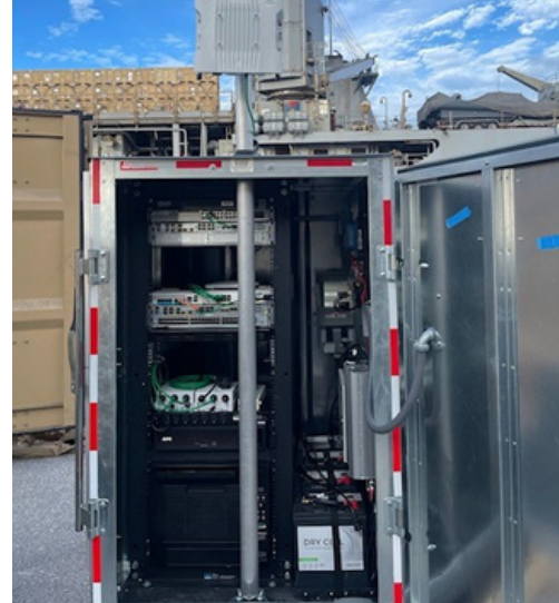
The Cube configured in Guam